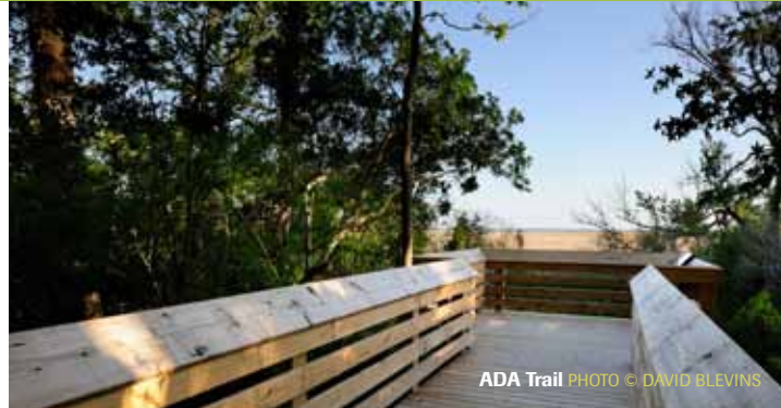
ADA Trail

The trail: This is a great trail for families. You will walk along several dune ridges, pass fresh water ponds and walk through dense forest.